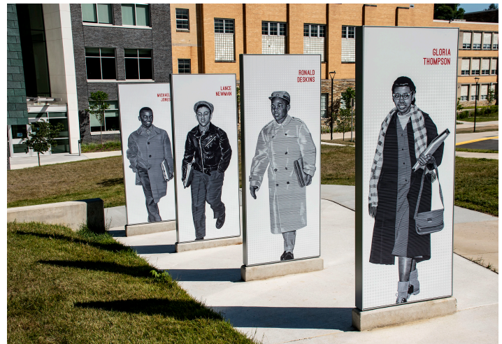
Tribute to Commonwealth of Virginia Student Activists — Civil Rights Interpretive Trail at the Dorothy Hamm Middle School, Arlington (VA) June 2021

The reference list reflects the thoroughness of the review. It also allows others to retrieve the cited publications. Errors made in authors' names, journal or article titles, page numbers and dates present barriers to retrieval of articles and prevent attributing credit to authors for their work. Each reference should be checked carefully for errors. Every in-text citation must have a listing in the references and every title in the reference list should connect to an in-text citation. 1